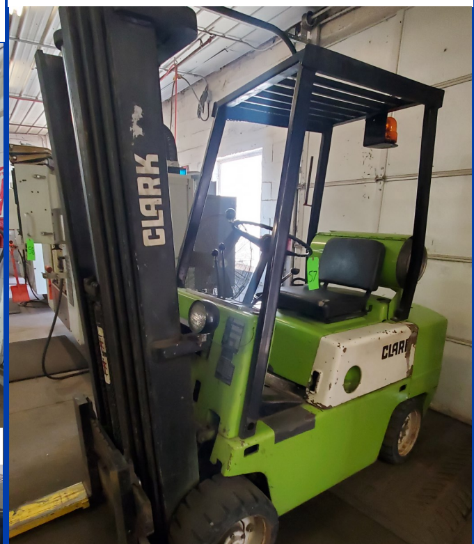
5,500 LB Clark Model C500-55 Propane Forklift