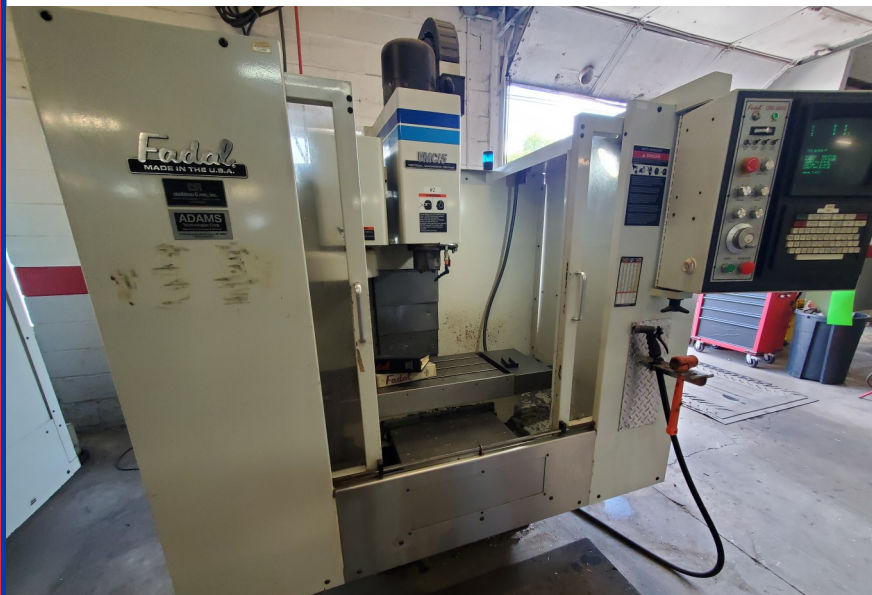
Fadal VMC 15XT Vertical Machining Center