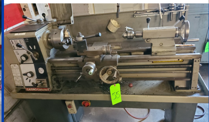
Clausing Colechester Model 11 Lathe