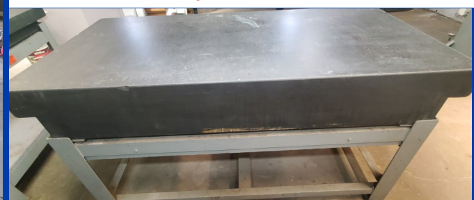
(10) Granite Tables