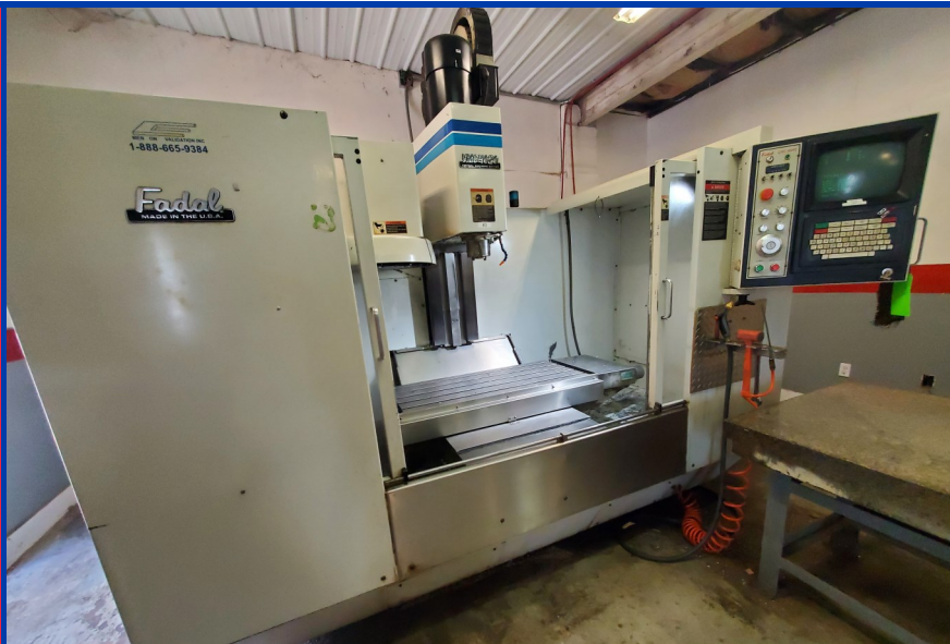
Fadal VMC 4020HT Vertical Machining Center