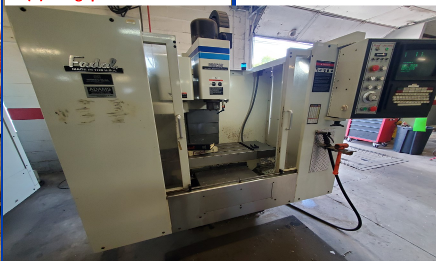
Fadal VM 15 Vertical Machining Center