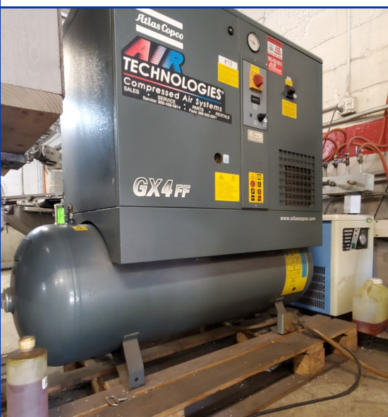
Atlas Copco Air Compressor