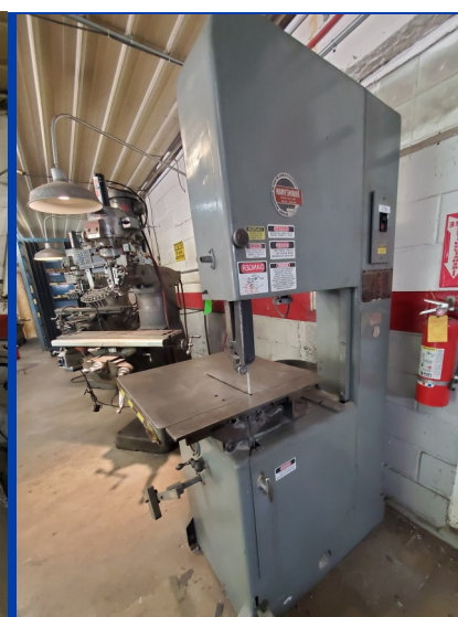
Journeyman Vertical Saw