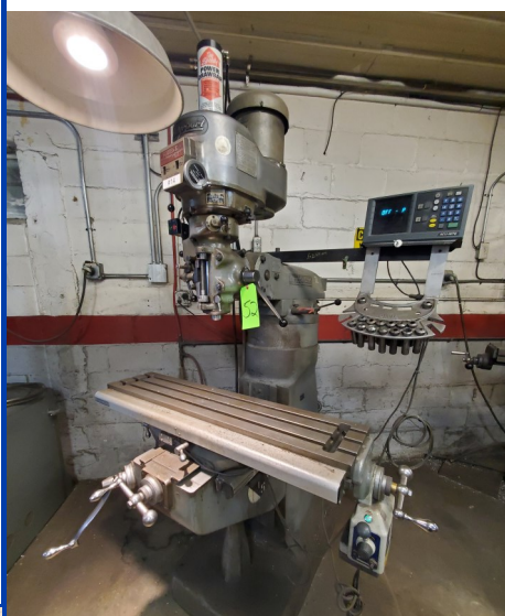
(3) Bridgeport Vertical Mills