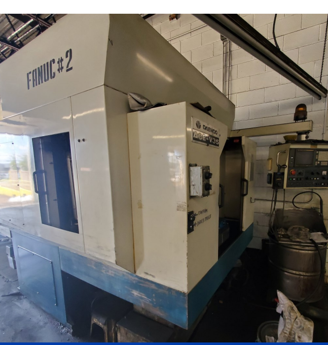
(2) Daewoo Ace V-35 w/ Fanuc Controls