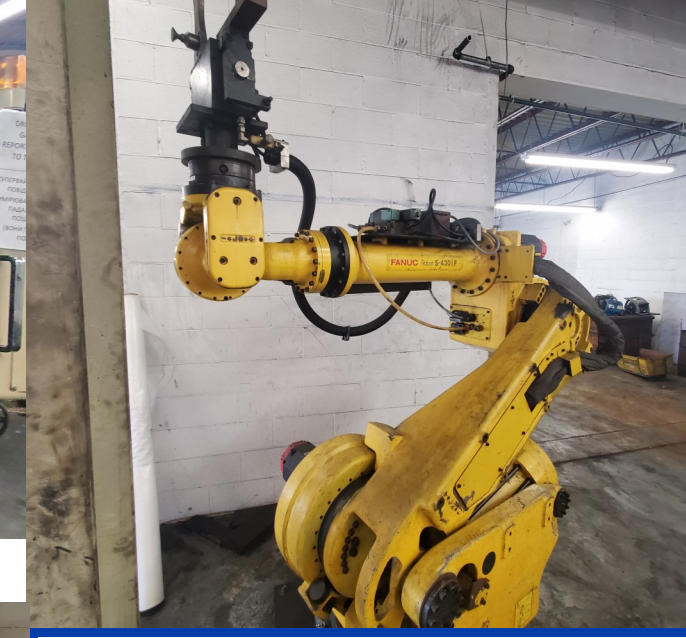
Fanuc S-430i Robot