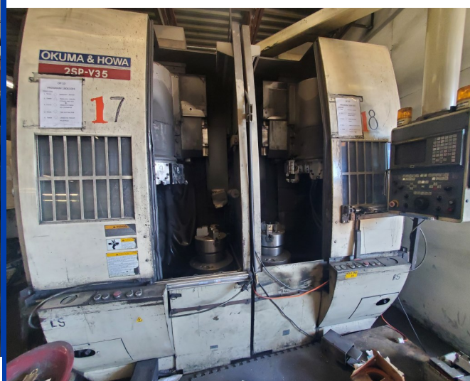
Okuma & Howa 2SP V35