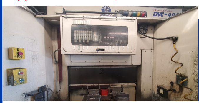
(2) Daewoo DVC-400 w/ Fanuc Controls