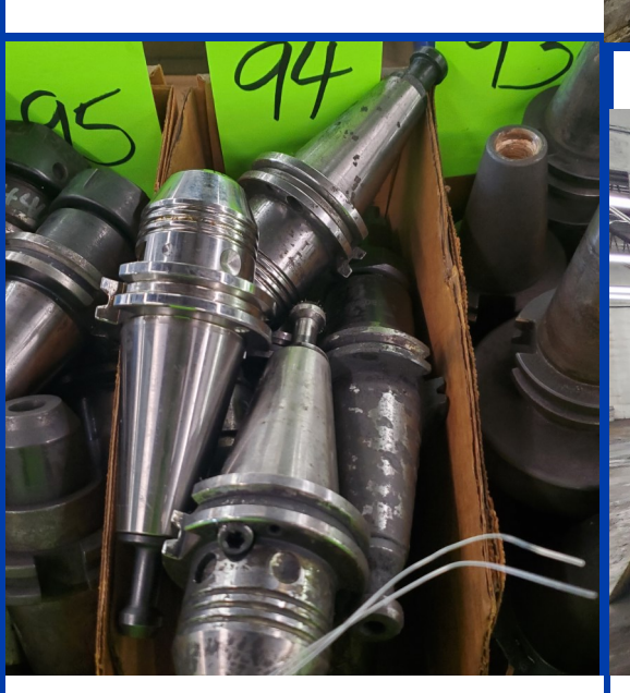
Tooling & Accessories