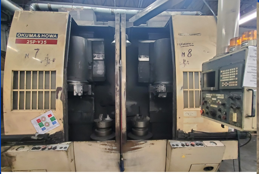
Okuma & Howa 2SP V35 w/ Fanuc Controls