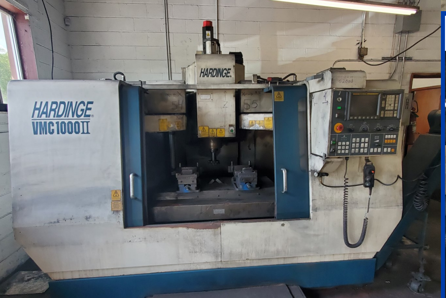
Hardinge VMC 1000 II